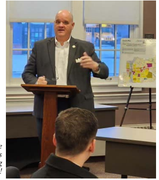
Updating the Fayetteville Village Board and residents on the great things happening in Onondaga County!