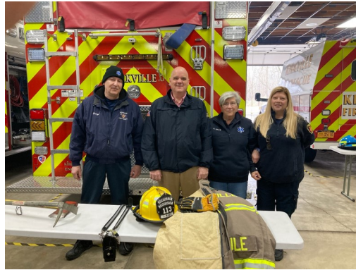
Having been a volunteer firefighter since I was a teenager, I have personally seen the number of volunteers dwindle in recent years. So I was more than happy to visit each of the four departments in the 10th District during RecruitNY, a statewide effort to get more people involved. I'm pictured above at Manlius and Kirkville. Please consider giving some of your time. Just contact your department to get started.